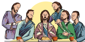
Worship Schedule for Holy Week